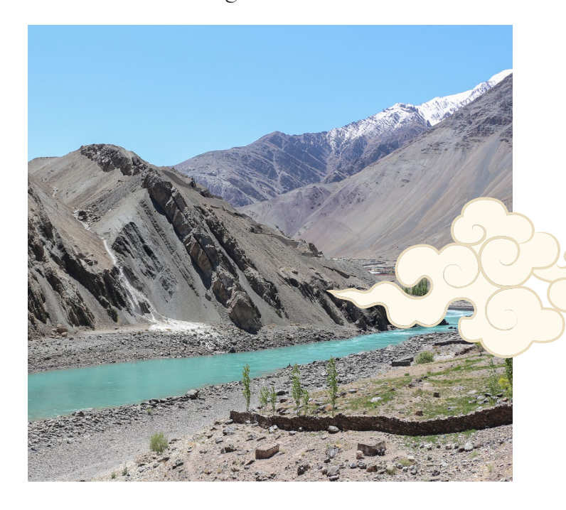
Day 3 Excursion to Khardung-la Pass

List of places visited – Alchi, Lamayuru, Pathar Sahib, Magnetic Hill, Hall of Fame.